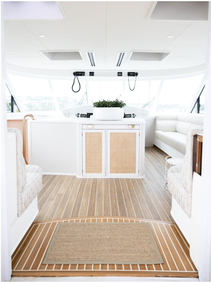
Upper Deck Main Saloon