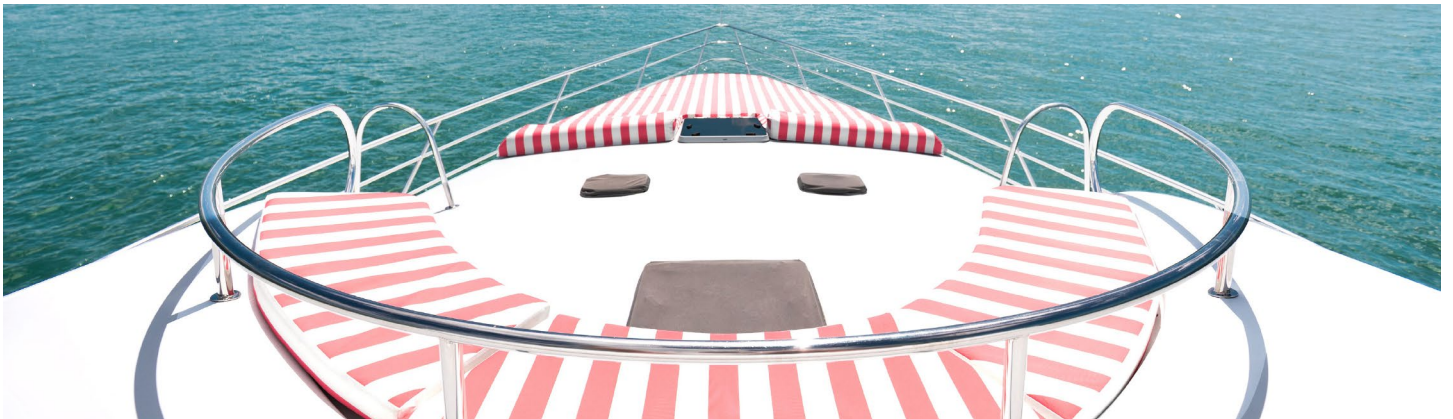
Bow Sun Lounge