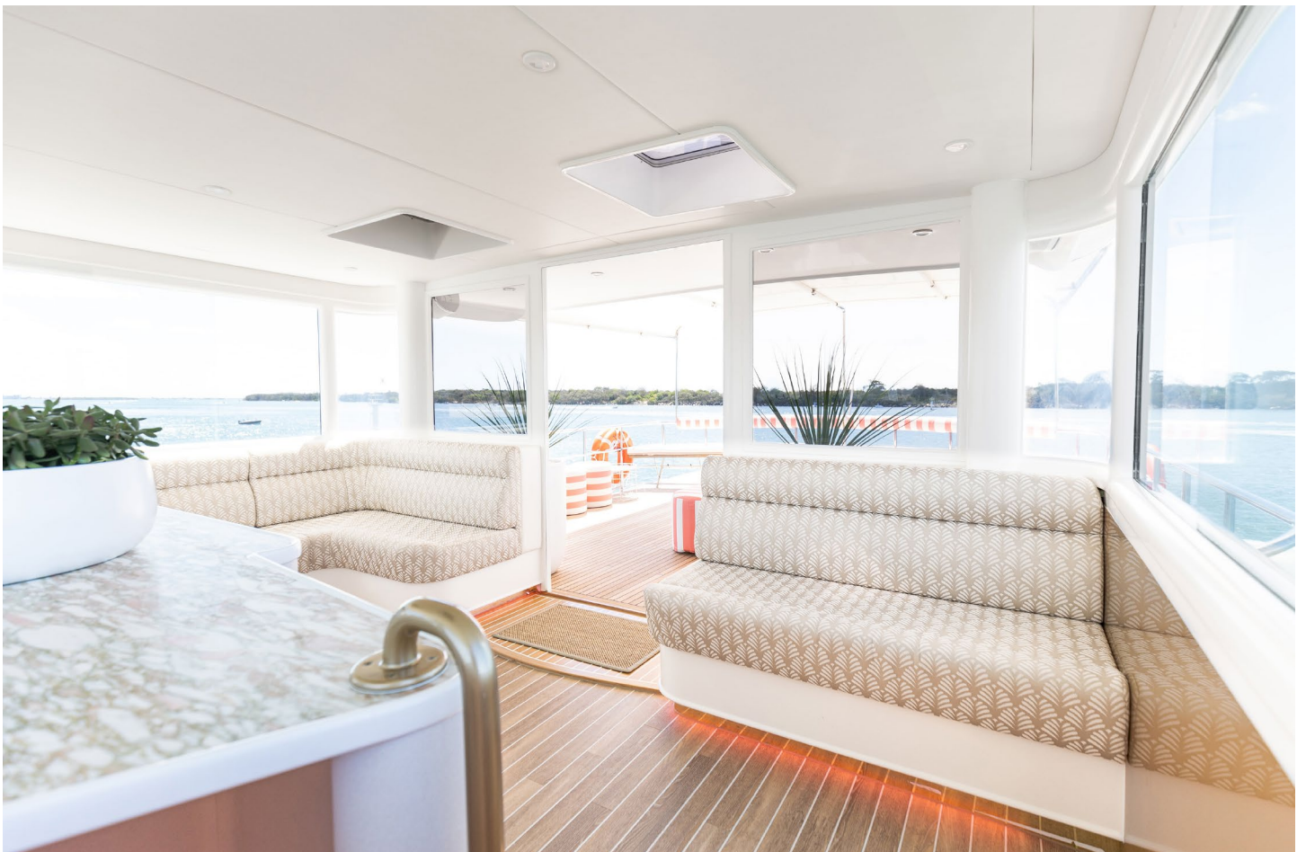
Upper Deck Main Saloon