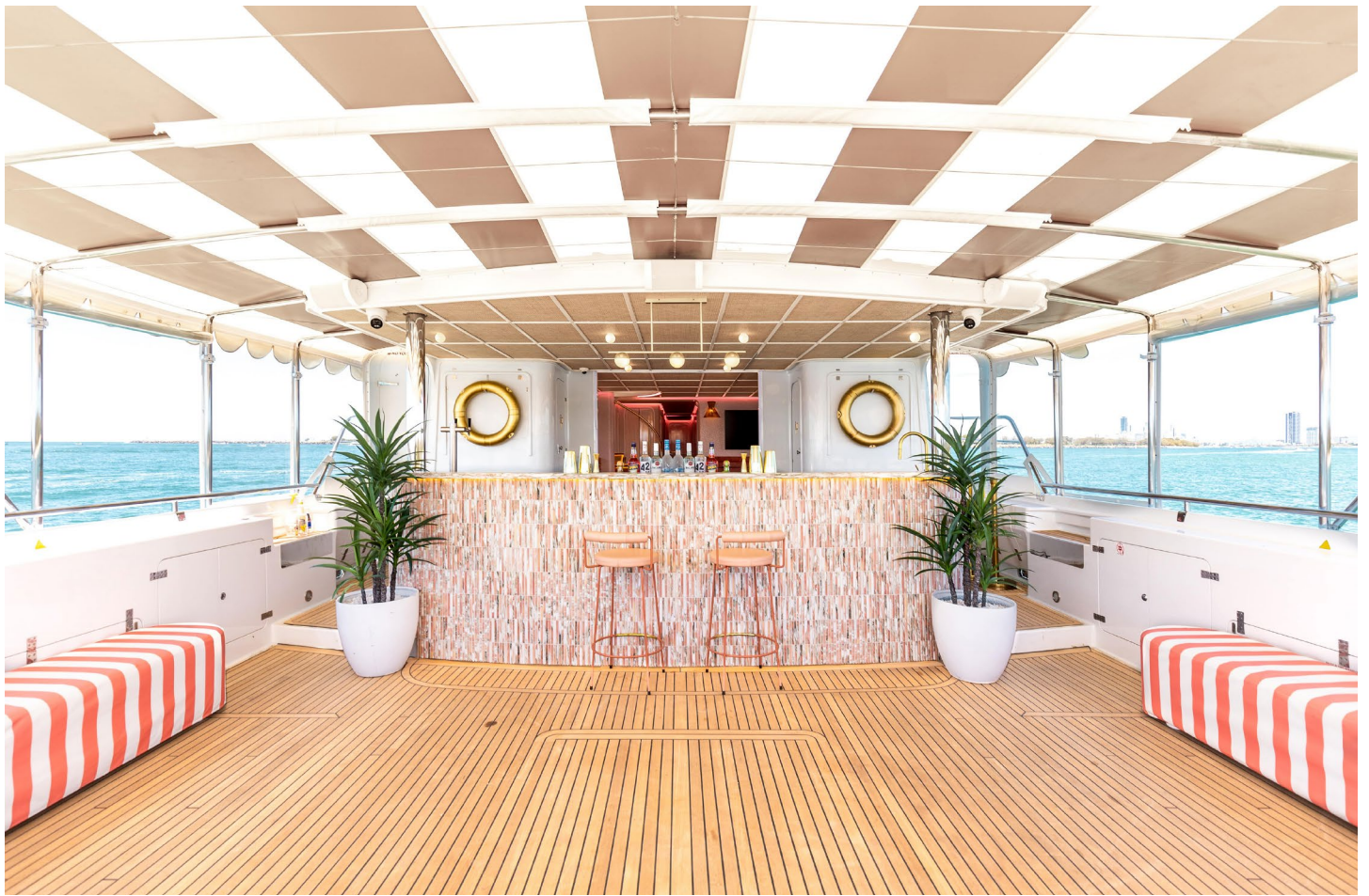
Lower Deck Bar