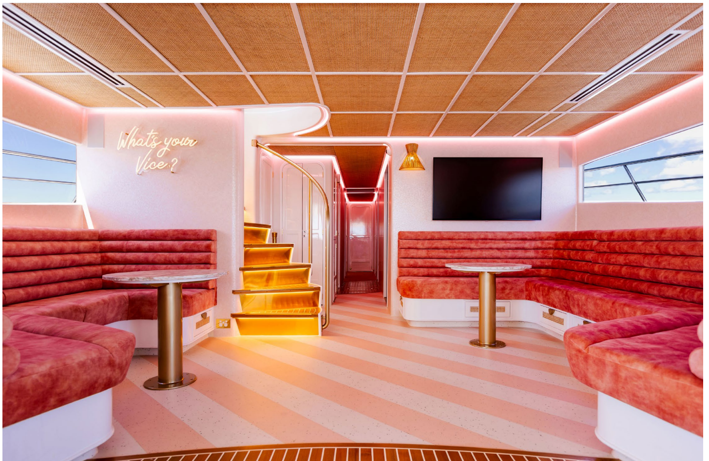
Lower Deck Lounge